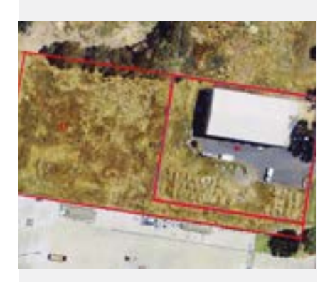
59 and 61 Gordon Street, Culcairn

comprising vacant allotment and adjoining industrial shed vacant possession (lettable area 551 sqm) total 6,748 sqm to be sold via public auction at 11.00am onsite 18 August 2023.