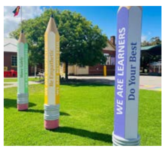
^ Henty Public School.

Parents can have confidence in the knowledge that their children are in a safeand supportive environment, receiving quality care from experienced professionals.