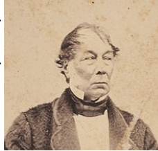
Mr Hamilton Hume

Our little township in the south-west of the Riverina Region of NSW has quite an extensive and colourful history. The area is one of immense beauty, a fact certainly noted by the intrepid explorer Hamilton Hume; who, unlike most other explorers of the time, was Australian born.