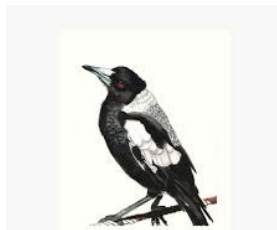
"Gerogery", Wiradjuri word for Magpie