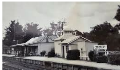
Inland Rail comes to Gerogery