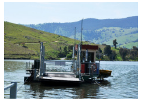
Pic Wymah Ferry and the Murray