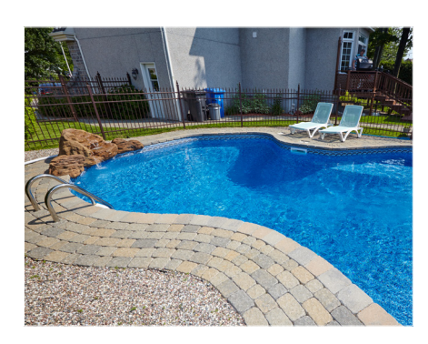
Pic Swimming Pool with Fencing