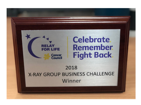
Pic X-Ray Group Business Award