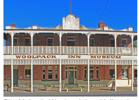
Pic Majestic Woolpack Inn, Holbrook