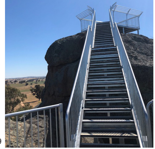
Pic New Stairs at Morgan's Lookout

For more information on the above grants and other grants available to community organisations and sporting groups please go to Greater Hume website, Grants and Funding page.