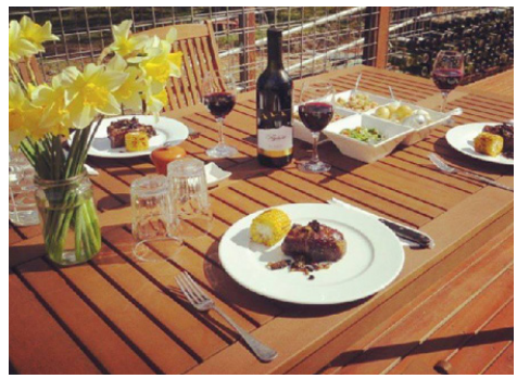
Pic Experience delicious local produce