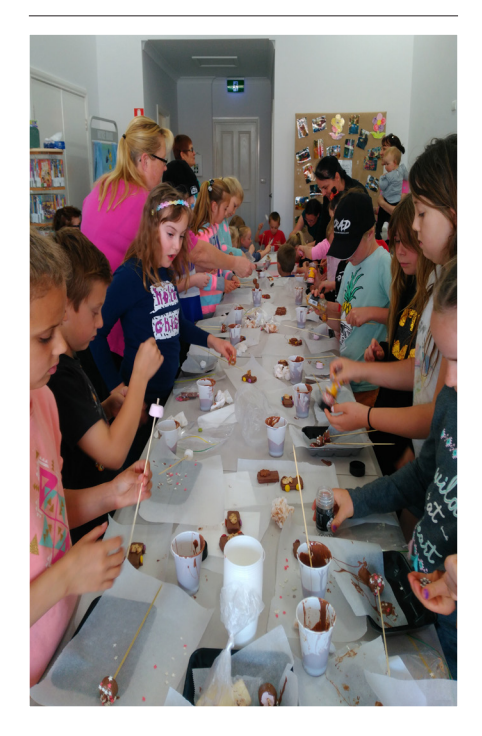
Pic Children creating chocolate delights during October School Holidays at Henty Library

Equally varied is the collection of children's books and movies, so bring your children in after school or on Saturday morning and broaden their minds with some great reading.