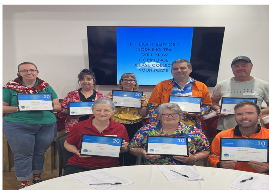
Pic Greater Hume Council Long Service Award Recipients.