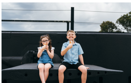
Pic HMAS Otway, Holbrook Submarine Museum, Holbrook

When the summer heat becomes too much to bear, the picturesque towns of Culcairn, Henty, Holbrook, Jindera, and Walla Walla offer beautiful swimming pools, inviting families to take a cool, refreshing dip. Laughter echoes poolside as young and old enjoy the water's embrace.