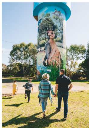
Pic Walla Walla Water Tower