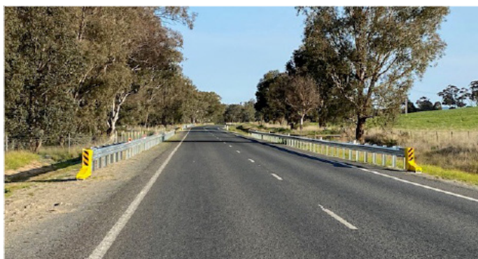
Pic Gerogery Road, Gerogery West drainage works and road reconstruction