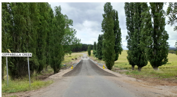
Pic Reconstructed Coppabella Bridge, Coppabella.

Greater Hume Council Engineering Department now provide a weekly works schedule on our website, go to https://www.greaterhume.nsw.gov.au/Living-in-Greater-Hume/Works-and-Projects to access.