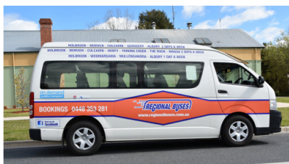
Pic The Regional Bus available in many Greater Hume locations.

The Regional Bus On Demand Service links the Greater Hume communities and is now also offering parcel pick up as well as it's normal bus service. The towns and villages being serviced are Albury, Burrumbuttock, Culcairn, Henty, Holbrook, Jindera, Morven, Gerogery, Gerogery West, Mullengandra, The Rock, Uranquinty, Wagga Wagga, Walla Walla and Woomargama.