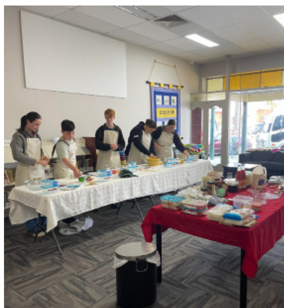
Pic Healthy Eating on a Budget workshop at the Culcairn Library.

Contact Council on 02 6036 0100 for more information.