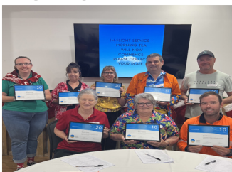
2 Out and About Greater Hume Council Long Service Award Recipients.