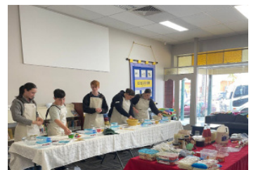
7 Our Libraries The September School Holiday programs at the Greater Hume Libraries were popular with many.