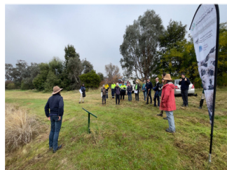
5 Holbrook Landcare Holbrook Landcare provides an update on their services around Greater Hume.