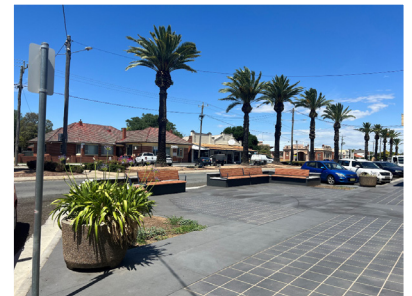
Pic Culcairn - New Balfour Street plaza area.