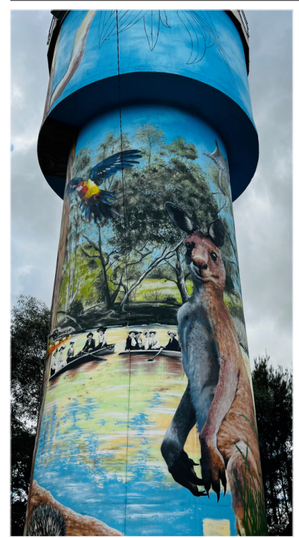
Pic Walla Walla Water Tower, kangaroo scene.

For more information on the program and recipients, visit <a href="http://www.gov.au/grants">www.gov.au/grants</a>.