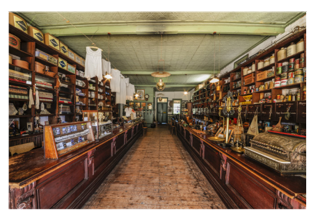
Pic Wagners Store, Jindera Pioneer Museum

To find more information on these day drives head to #visitgreaterhume.