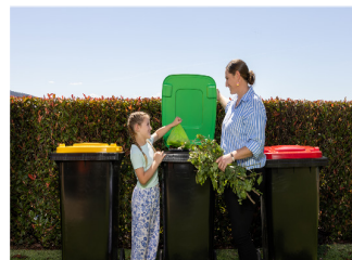
3 3 Bin System in GHC Did you know that you will soon receive a new Green Lidded Organics Bin?