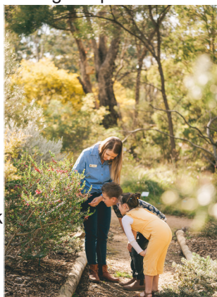
Pic Wirraminna Environmental Education Centre, Burrumbuttock