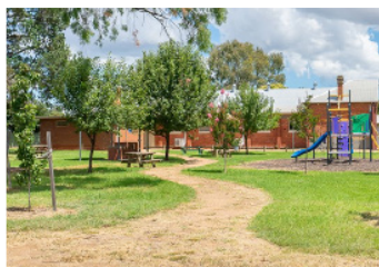
3 Community Projects Learn about the current community projects underway across Greater Hume.