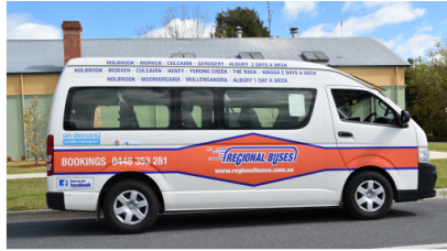
Pic The Regional Bus available in many Greater Hume locations.

The Regional Bus On Demand Service links the Greater Hume communities and is now also offering parcel pick up as well as it's normal bus service. The towns and villages being serviced are Albury, Burrumbuttock, Culcairn, Henty, Holbrook, Jindera, Morven, Gerogery, Gerogery West, Mullengandra, The Rock, Uranquinty, Wagga Wagga, Walla Walla and Woomargama.