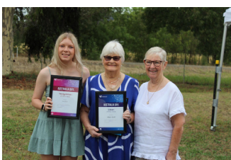
2 Australia Day 2024 Greater Hume Council Australia Day Recipients.