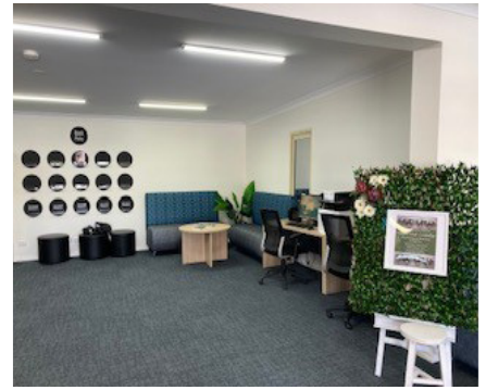
Pic Refurbished front entrance of the Henty Library

The festivals will be free events with morning tea and lunch included. Come along to enjoy music trivia, a presentation by Stephanie Dunstall