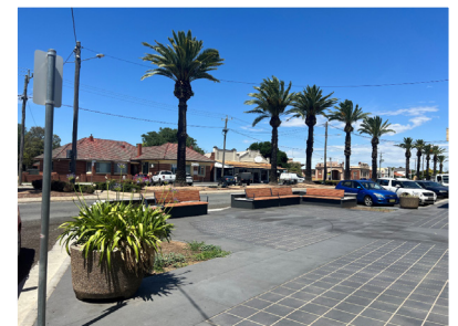
Pic Culcairn - New Balfour Street plaza area.