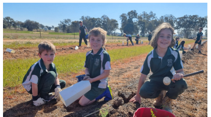
Pic Planting Day with Walla Walla Public School.