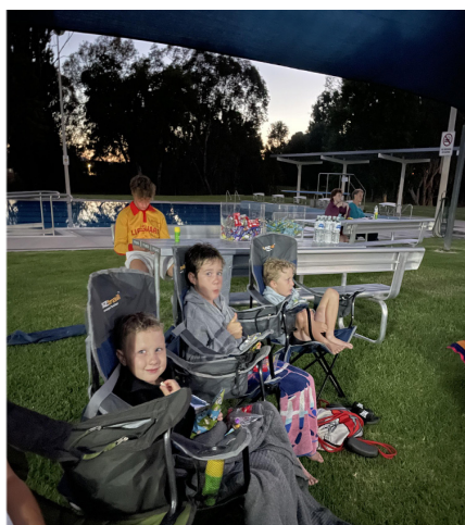
Pic Movie Night at the Holbrook Pool.

Open Monday - Friday 8.30am- 5.00pm (closed 1.00pm-1.45pm).