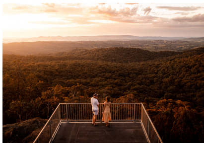
Pic Yambla View, Wambariga Lookout, Woomargama National Park.

For the avid hikers among us, the Hume and Hovell Track beckons with its promise of rugged beauty and exploration. Beginning at Coppabella Creek and winding through the beautiful Lankeys Creek, this trail leads adventurers through the picturesque Woomargama National Park, offering ample opportunities for camping, picnicking, and breathtaking lookout points. Finally, the journey concludes near the charming villages of Wymah and Bowna, providing a satisfying conclusion to a memorable trek.