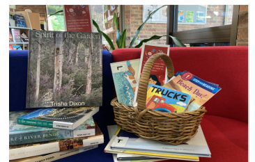
7 Our Libraries Read about the exciting programs and events occurring in the Greater Hume Libraries.