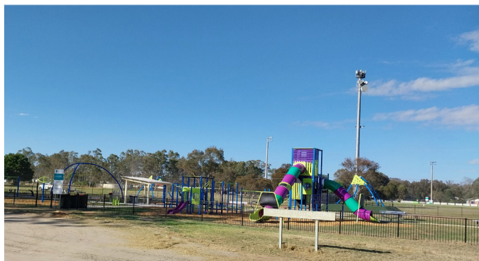
Pic New Adventure Playground at the Jindera Recreation Ground.

Greater Hume Council Engineering Department now provide a weekly works schedule on our website, go to https://www.greaterhume.nsw.gov.au/Living-in-Greater-Hume/Works-and-Projects to access.