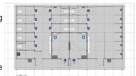
Pic Greater Hume Council endorsed floor plan for new toilets at Burrumbuttock Recreation Reserve.