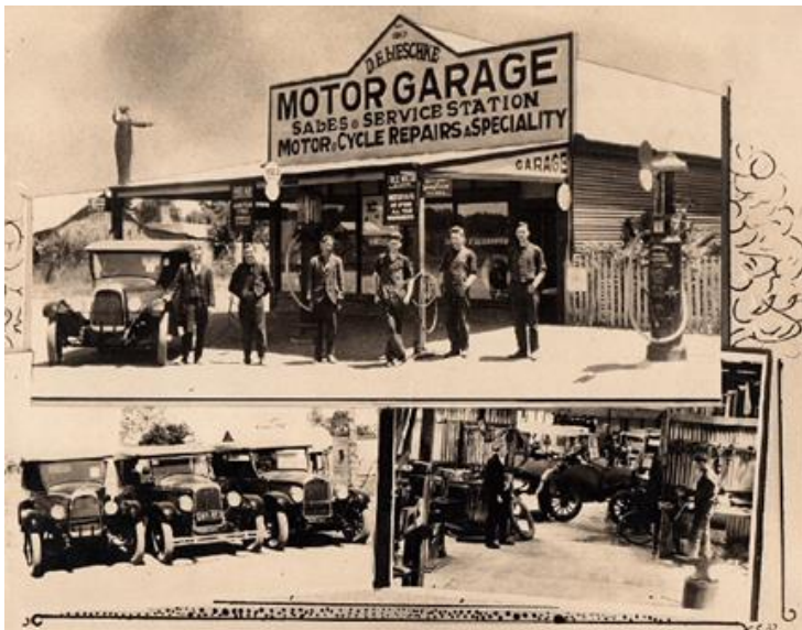
Above: The garage in 1924, the year the policeman was placed on the roof. The workshop is on the bottom right. Bottom left: Whippet, Essex & Buick cars