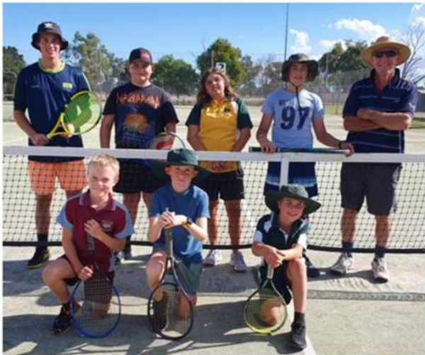
Advanced Group ( the old chap on the right back is hoping to learn a few skills)

The club has been successful in attracting grants to replace the old fence around courts 1 to 4. We applied to 3 funding bodies and were successful with all three!! We are at present negotiating with the funders on how we can maximise the amount we need. It is anticipated that the fence will be built over the winter months. This will enhance the tennis area and complement the new building. The old fence was erected in 1965 so I suppose we deserve a new one.