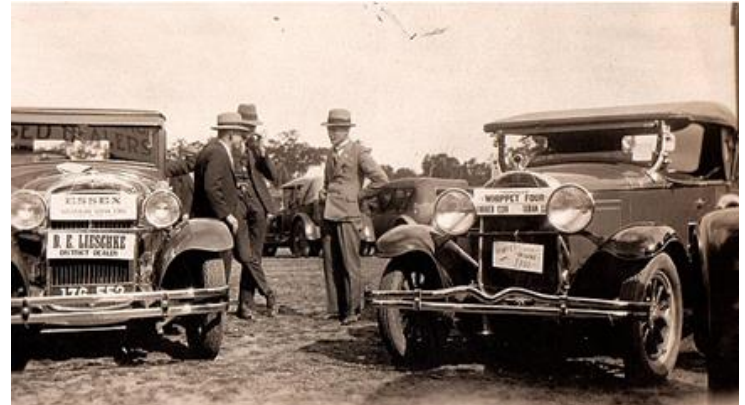
Above: Essex (left) and Whippet (right) at the 1928 Walbundrie Show.