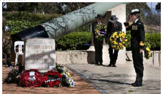
Below: Rear Admiral Katherine Richards

References: https://en.wikipedia.org/wiki/History_of_the_Royal_Australian_Navy ; https://hub.williamsfoundation.org.au/event-4614366 ; https://www.aph.gov.au/About_Parliament/Parliamentary_Departments/Parliamentary_Library/Publications_Archive/archive/womenarmed