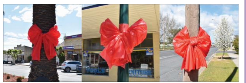
Above: Red Bows decorated Greater Hume's five main towns last Christmas.

You might recall the red bow project last Christmas which featured red bows in Greater Hume's five main towns. The project was made possible by grant funding received from the Riverina Water Community Grants program, Greater Hume Council and volunteers from Rotary Club of Holbrook, Culcairn, Henty and Walla Walla Community Development Committees, and Henty and Jindera Lions Clubs.