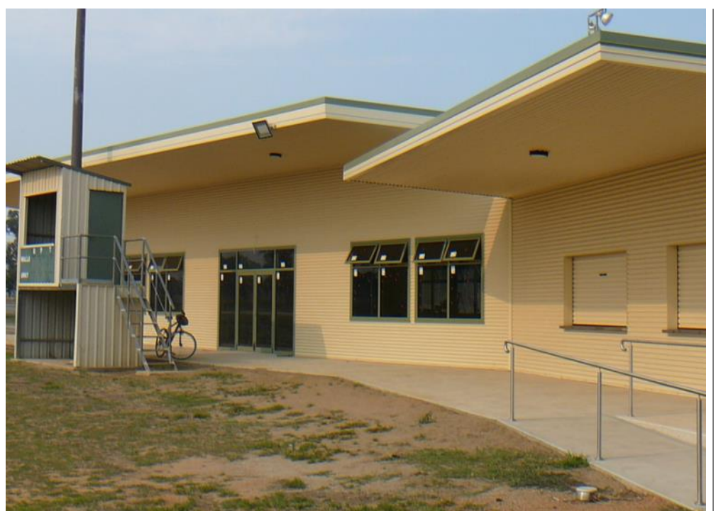
Above: The new community facility