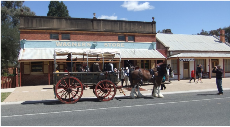
The Walla Wagon leading the Jindera parade.