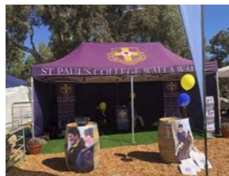
Above: The SPC tent at the Henty Machinery Field days.