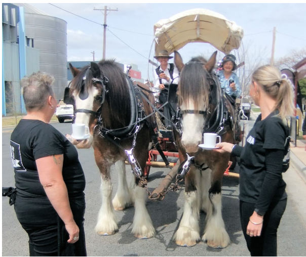
The Cappuccinos on offer by DJ's Fine Fast Food.