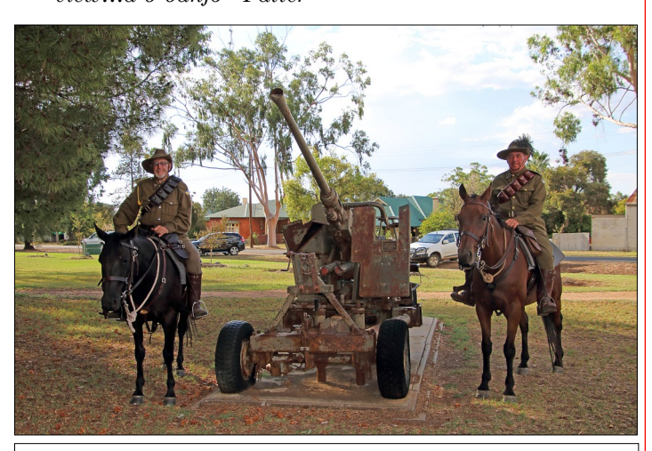
Riders participating in the Chauvel Light Horse Ride reenactment gathered at the Henty Memorial Park