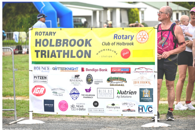
Triathlon Sponsors sign.