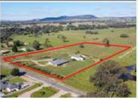
ARCEAGE ON THE EDGE OF TOWN