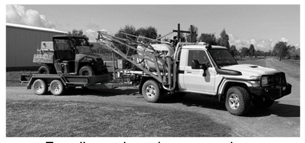
For all your broadacre spraying and spot spraying needs.