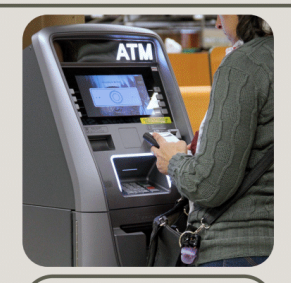
ATM FACILITIES ON-SITE