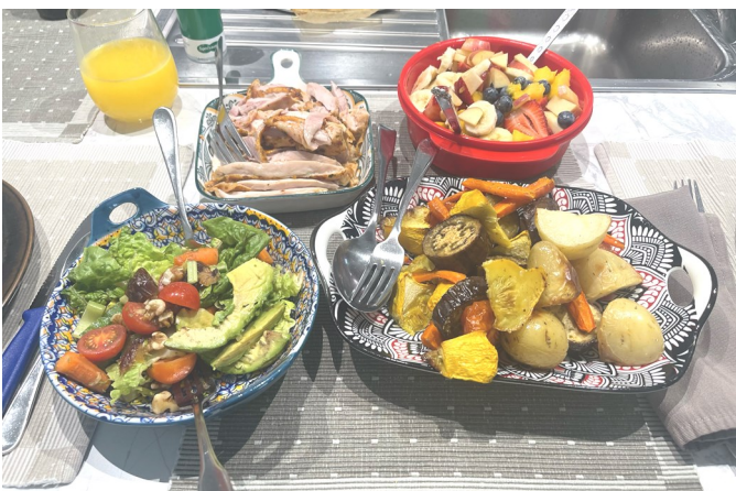
Community Gardens vegetables adding nutrition and enjoyment to a summer meal.

The Holbrook Community Gardens is finalising a date for Aged Care residents in Holbrook to visit. A number of children have visited and picked ripened vegetables — zucchini, leek, tomatoes, cucumber and squash. The public are invited to pick our beautiful produce and leave a donation, so we may replenish and replant. And finally, a special “thank you” to the people who water regularly during these summer months. We look forward to an active and wonderful year.