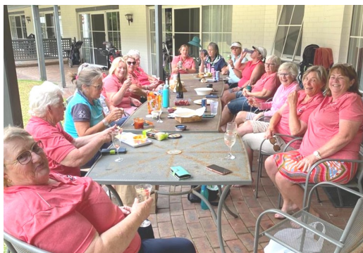
Left: Holbrook Women's Golf Trip to Tocumwal 2023