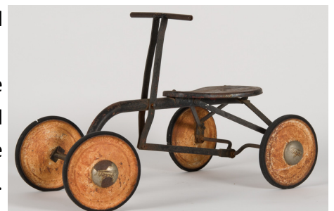
Pictured above is a Wallaby Bike. Designed for children with polio who couldn't use their legs, this bike allowed them to use their arms.

Take the opportunity to explore the museum and experience "Stepping into the Past." Don't miss our newly refurbished bar and entry room, where you'll find three stunning historic photos of the Criterion Hotel on display, adding a unique charm to the area. Throughout the day, enjoy activities such as soap making, spinning, and weaving. Kids will have a blast with the "Find the Object" hunt, the "Try Me" table, and large wooden outdoor games. We look forward to seeing you there!