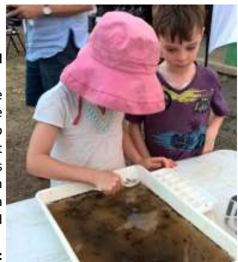
Checking for waterbugs in a sample of water from a farm dam.

Fox Baiting: Murray Local Land Services has begun its Autumn