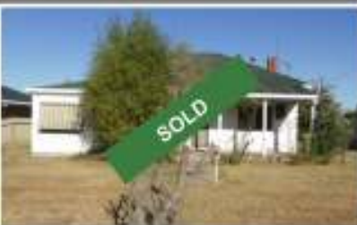
81 Peel St, Holbrook