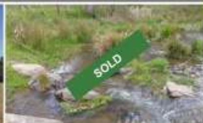
39 Lochiel Rd, L' Creek