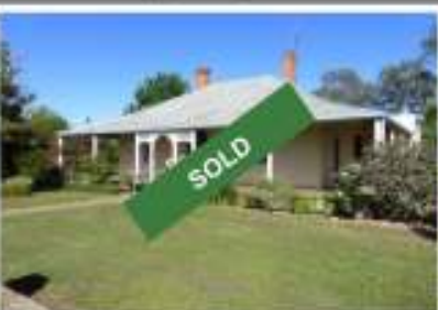
167 Albury St, Holbrook