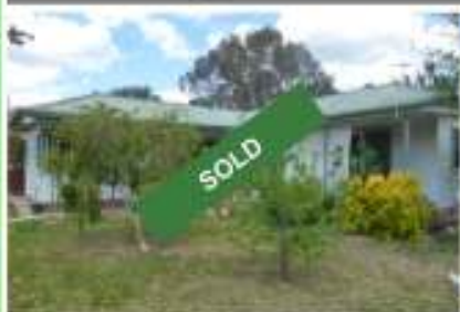
44 Swift St, Holbrook