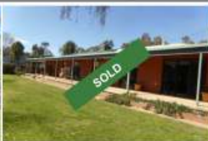
26 Dickson St, W'Gama