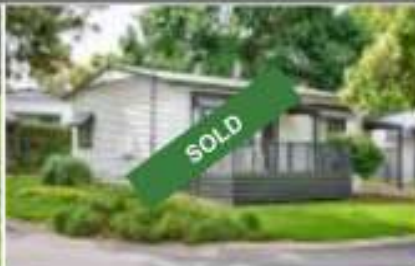
16 Brushbox St, LHV