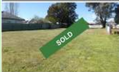
150A Albury St, Holbrook