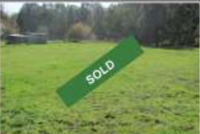
45-49 Macinnes St, Holbrook