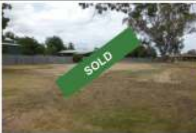
44 Wallace St, Holbrook