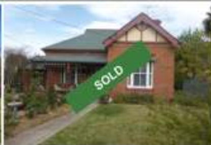
22 Swift St, Holbrook