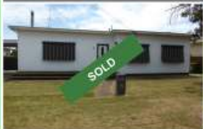
75 Peel St, Holbrook