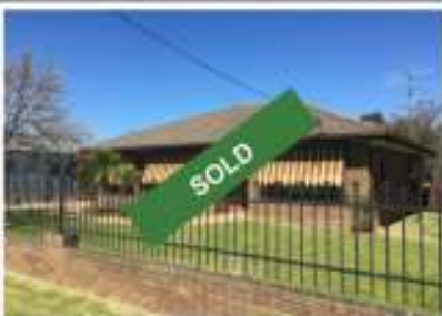
50 Young St, Holbrook