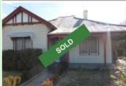
31 Peel St, Holbrook