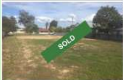
179 Albury St, Holbrook