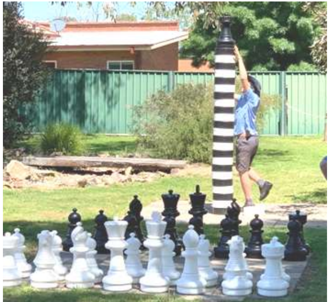
Enjoying the challenge whilst playing on school grounds.

In partnership we continue to build our humble little school. Always remember, 'From Little Things Big Things Grow' .