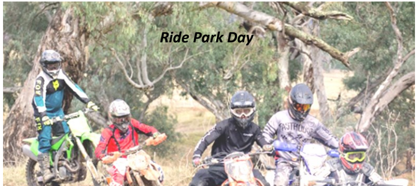
Ride Park Day