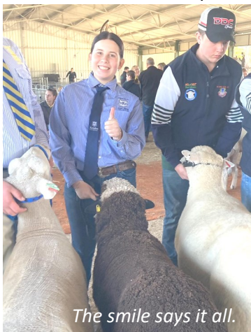
The smile says it all.