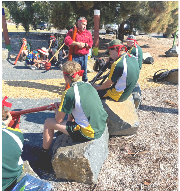
The Wiradjuri learning program at the Yarning Circle

The next meeting is Tuesday 6 th August 7pm via Teams and we will enjoy a presentation from the Student Representative Council (SRC) who are leading great things from the school. Everyone is Welcome!