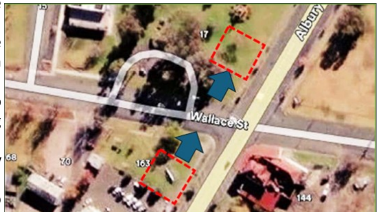
Proposed relocation of the ‘Submarine, scale model’ to 17 Wallace Street, Holbrook, also known as ‘Germanton Park’