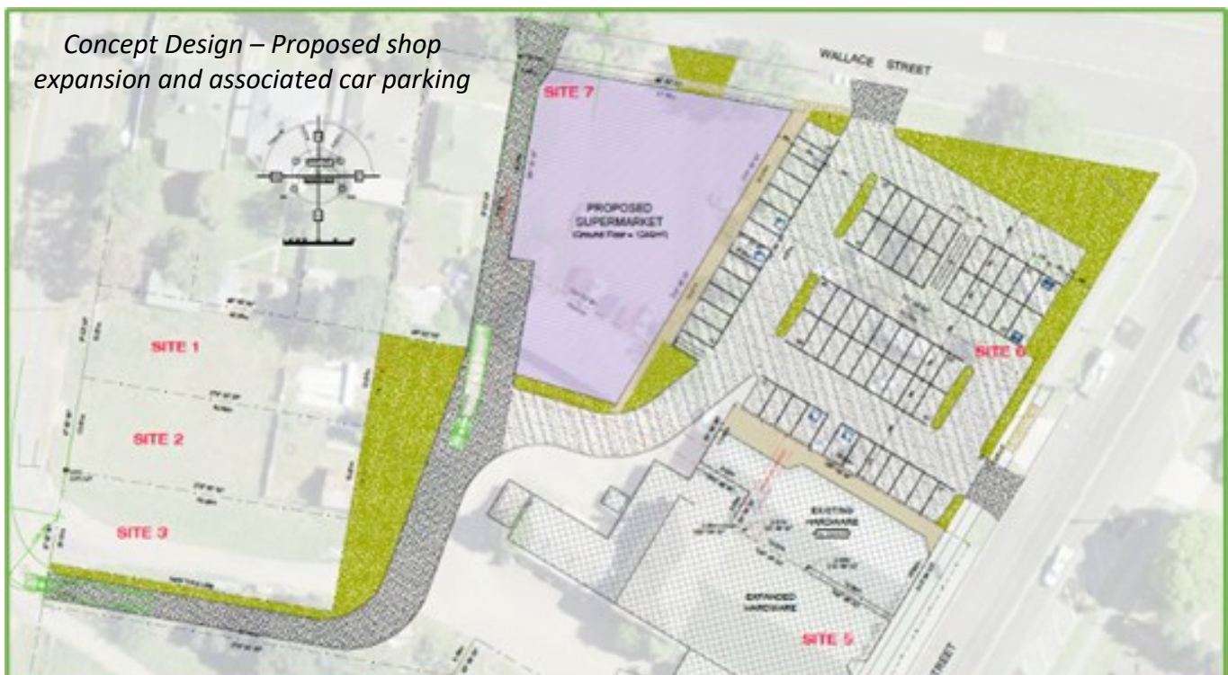
Concept Design – Proposed shop expansion and associated car parking