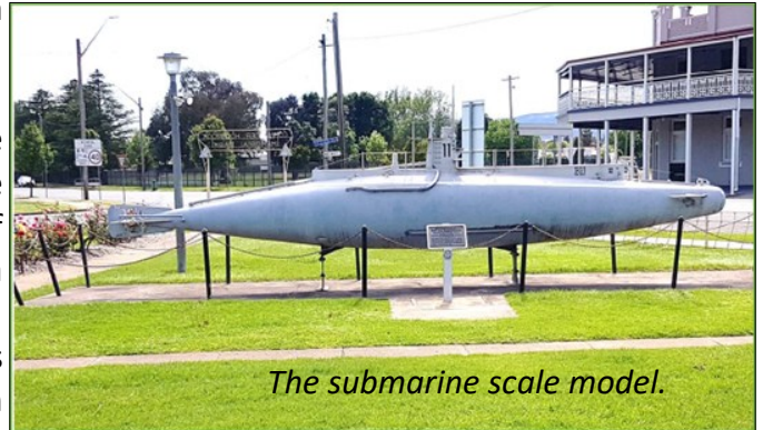
The submarine scale model.

Any interested persons are welcome to attend and raise issues or concerns regarding the proposed reclassification. No registration is required to attend the hearing.