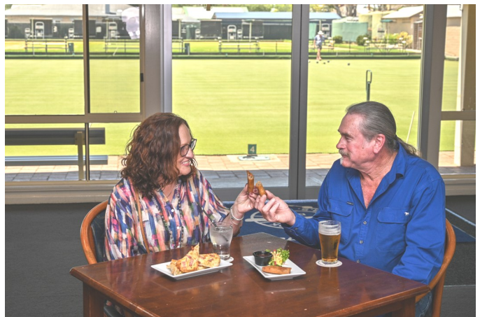
Holbrook R.S. Club

So come and indulge in the culinary delights and rural charm that Greater Hume has to offer. Whether you're warming up by fires in bakeries or enjoying the bustling warmth of cafes, your journey through this region promises to be delicious, memorable, and distinctly heartwarming.