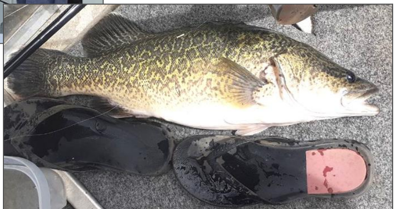
Flynn O'Neill aged 11 caught and released this great 60cm cod at the DG Comp, no brag Matt just 2 size 10 thongs. He now has a brag mat. Well done buddy