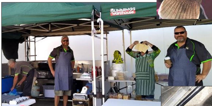
Great job gang ... fundraising at Bunnings