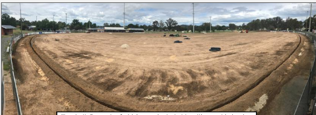
Football Ground refurbishment included levelling and irrigation