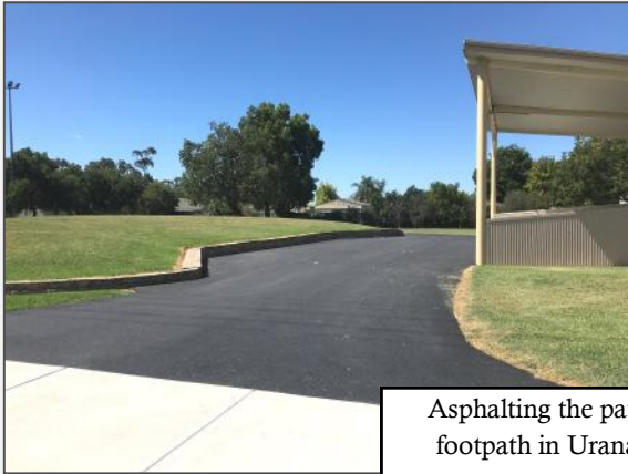
Asphalting the paths at the Village Green and new footpath in Urana St alongside the Village Green