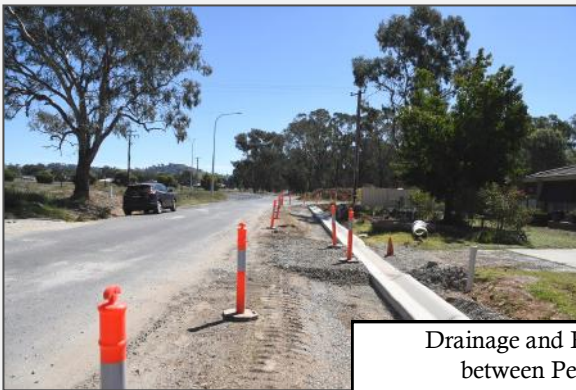
Drainage and Road Works in Pioneer Drive between Pech Ave and Jindera Street