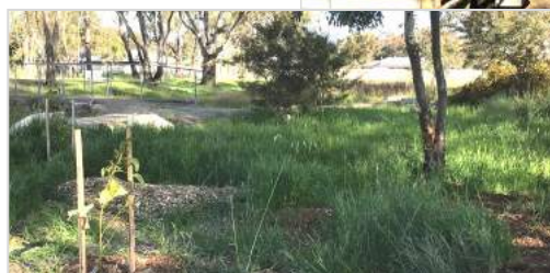
Now a clearer view into the woodland area.