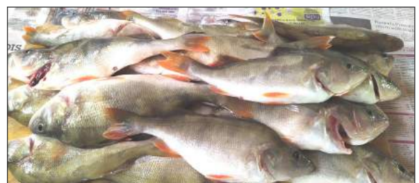
The English perch are still biting well at the weir