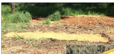
The site prepared before installation of the seat

Robert Done - (For the Friends of Jindera Wetlands)