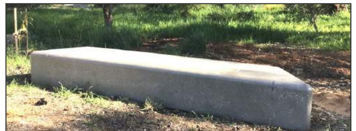
The new seat at the Jindera Wetlands

So, when you are next walking the dog why not 'come and sit for a while.'