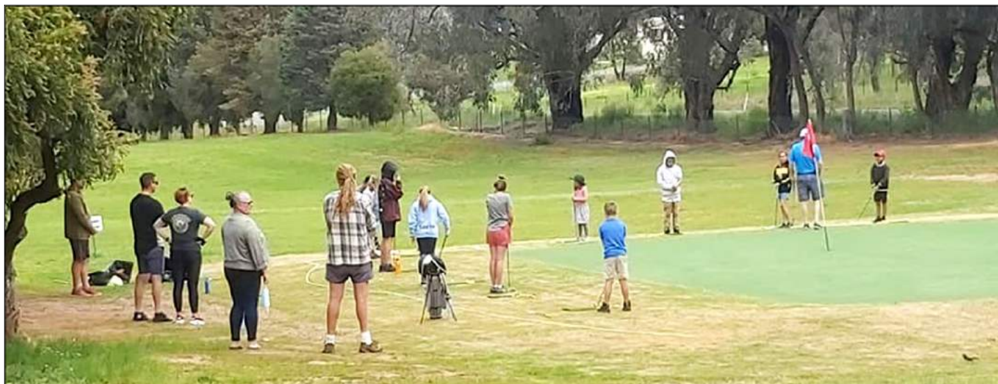
Kids having fun during the junior golf.

Happy golfing ... .. get a friend or take the family along and enjoy the Jindera Golf Course !