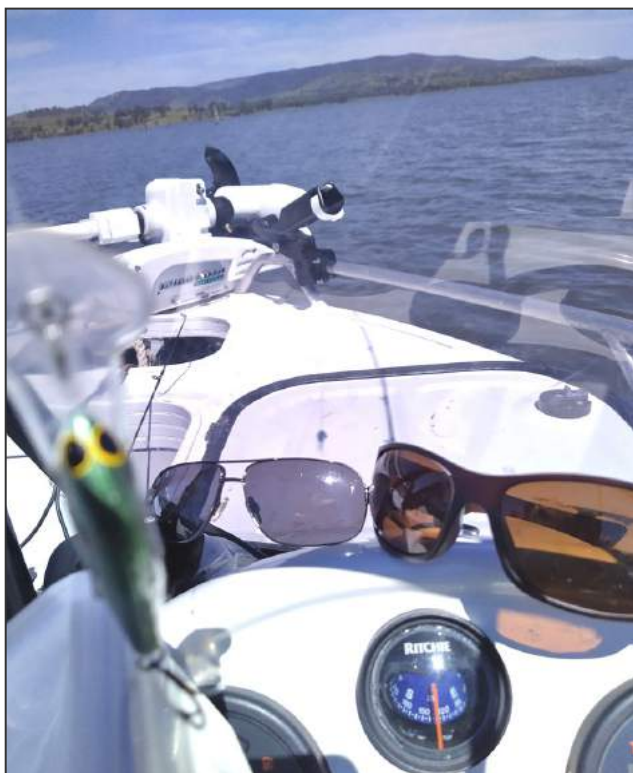
Ahhh!!! the tranquility of a day's fishing, take note of the lure